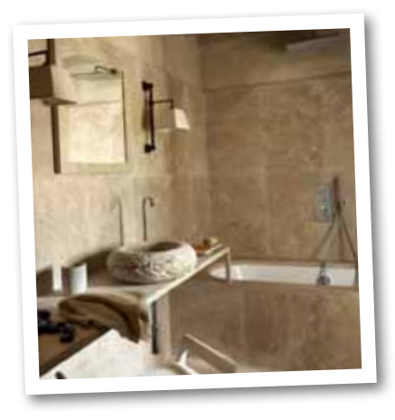
Off the peater path...